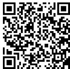
Director ENVINZOA Nagpur

and is valid through till next proposed audit on/before July 28, 2024.