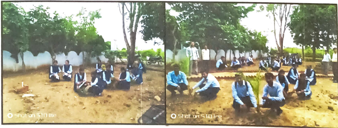
IQAC CO-ORDINATOR Mahatma Gandhi Arts & Commerce College Parseoni, Dist. Nagpur